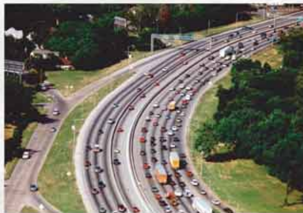
Traffic Congestion on Interstate Highway 30

Property acquisition was a concern for some property owners in residential areas. The study team is currently evaluating multimodal options in the IH30/US 80 corridor. If roadway improvements are recommended, it will take time to pinpoint where specific right-of-way is needed and evaluate the impact to those areas.